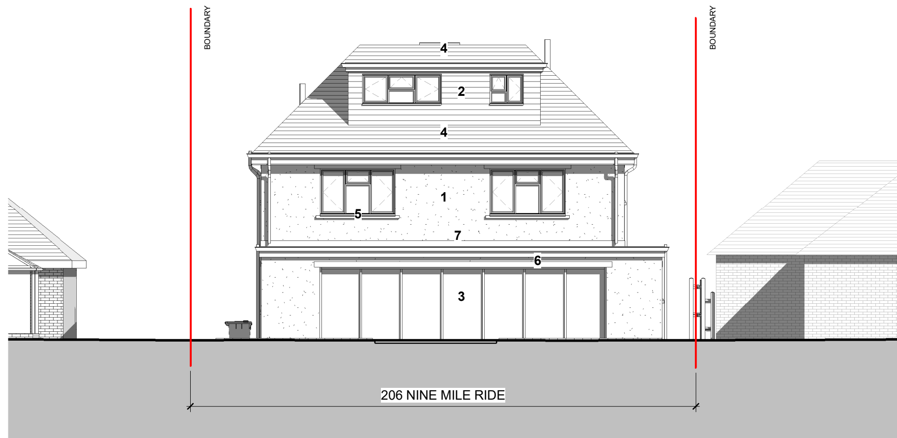
REAR ELEVATION - SOUTH