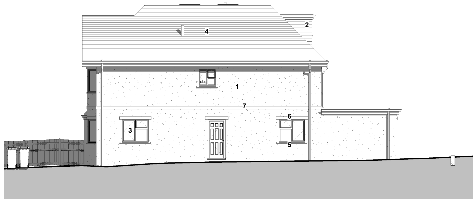
SIDE ELEVATION - WEST